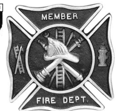
Grave Flag Holders