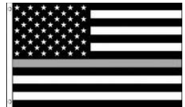
Thin Red Line Flags