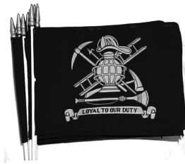
Firefighter Stick Flags